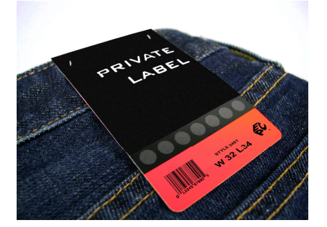
Figure 2-2 Paper hang tags with integrated RFID tag.

Hang tags: RFID-based EAS device integrated into paper hang tag (swing ticket) or pocket flasher.