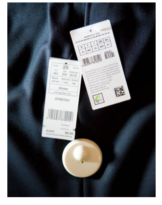
Figure 2-10 Three tags on single garment. Tags include source tag, RFID tag, and EAS tag.