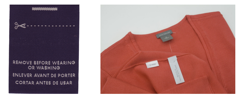
Figure 2-1 Sewn-on tag<sup>2</sup>

Hang tags: RFID-based EAS device integrated into paper hang tag (swing ticket) or pocket flasher.