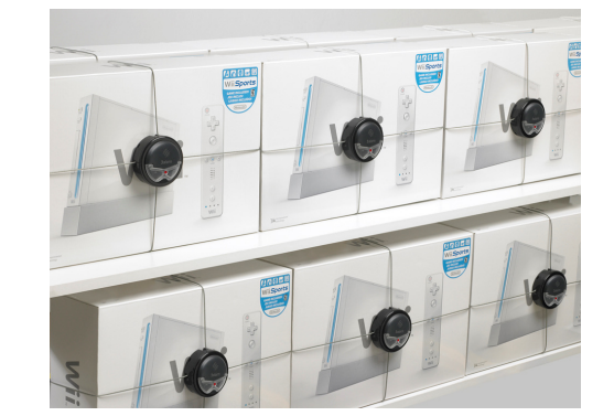
Figure 2-8 Reusable hard tags attached to electronics