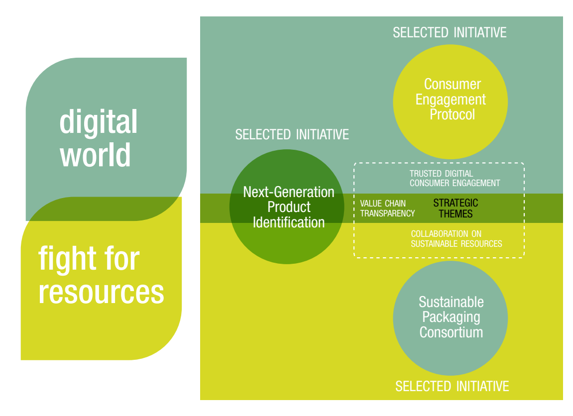
FIGURE 3: MEGATRENDS AND INDUSTRY INITIATIVES: HOW THEY ALL FIT TOGETHER

Source: The Consumer Goods Forum, Capgemini